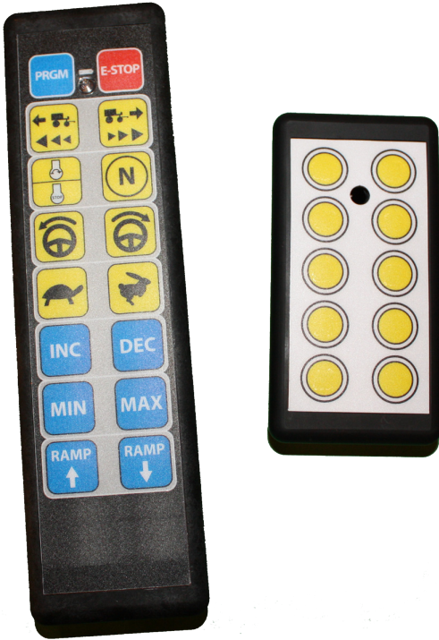
Photo for reference only. Customer specific overlay shown.