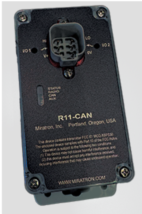
Full-color custom labeling and branding available

CAN Output Radio Receiver in a compact, waterproof package.